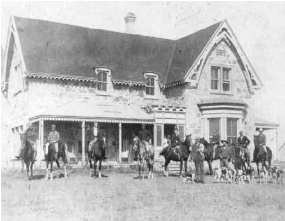
Figure 1. Fox hunting on the Canadian Prairies

A similar argument may be made of modernist educational institutions that are attempting to impose their authority on dynamic multi-literacy practices (including digitally-based communications, interactive multi-media texts, and fluid identities) in postmodern times. Through a close reading of the Western Northern Canadian Protocol's (WNCNP) Common Curriculum Framework for English Language Arts (CCFELA) which draws on Bruner's (1986) notion of 'constitutive' language, we assert that there exists a tension between modernist high stakes evaluation methods, the prescriptive intentions of the general outcomes of the WCNP, and the post-modernist realities of contemporary students' emerging multi-literacies. We believe that, as illustrated in the analogy of Cannington Manor, traditionalist educational sensibilities as expressed in curricula such as the WNCNP will give way to the energies of changing literacy landscapes.